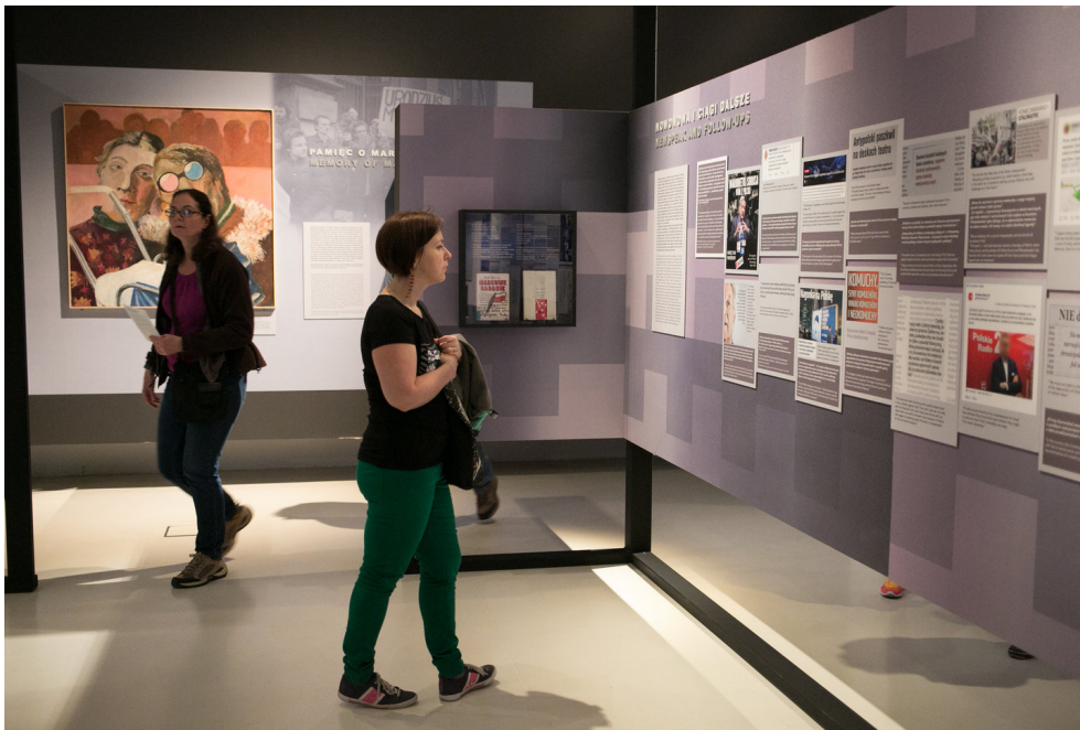
View of the most controversial final section of the exhibition showing contemporary media images and texts that use the mechanisms of exclusion