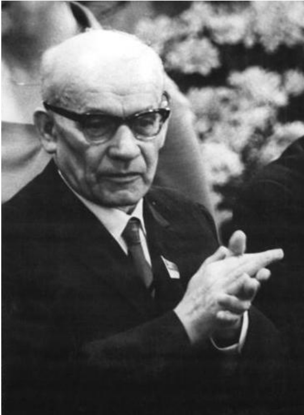
Władysław Gomułka, April 1967