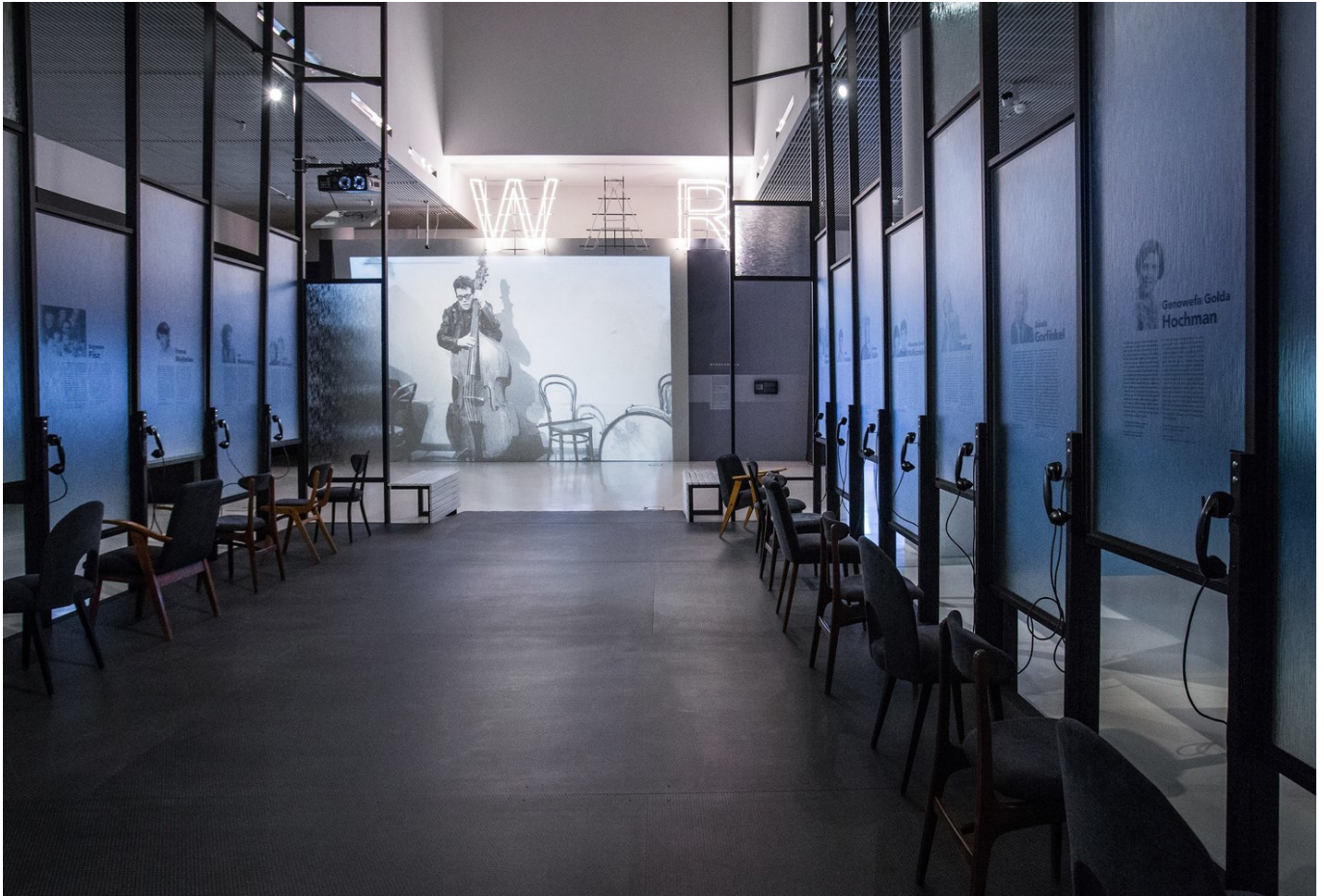
The 'waiting room' at the train station Warszawa Gdańska