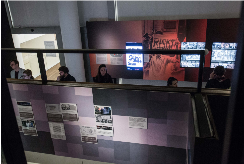
Final section of the exhibition - view from above Author: Magda Starowieyska; Source Museum Polin