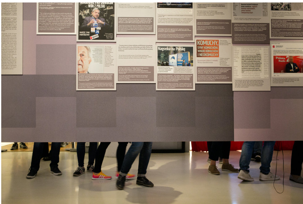
Wall with contemporary anti-Semitic media images

Author: Magda Starowieyska; Source: Museum Polin