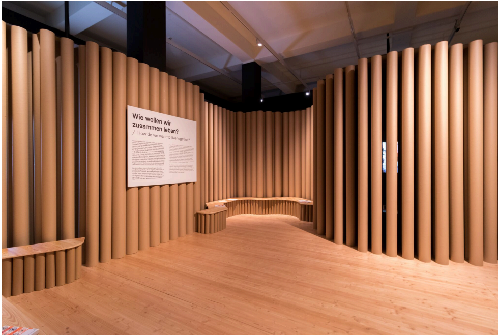
Architectural installation designed to provide space for communication