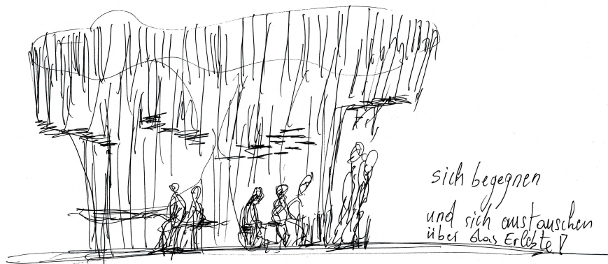
Sketch by the architect Diébédo Francis Kéré of the spatial installation of the last room Author: Kéré Architecture