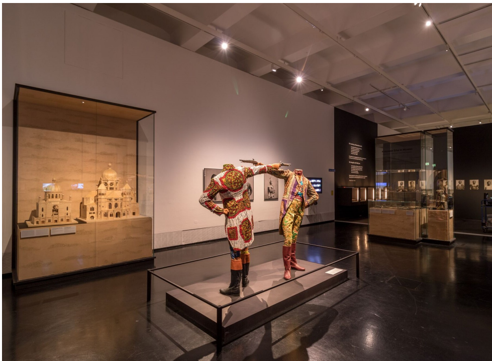
Section on colonial legacies with models of architecture in an "Oriental" style in the left back and an artistic sculpture supposed to trigger questions about postcolonial identities.