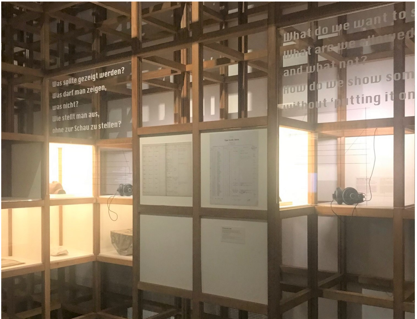
Racism exhibition: Meta-reflections on how to display racism.