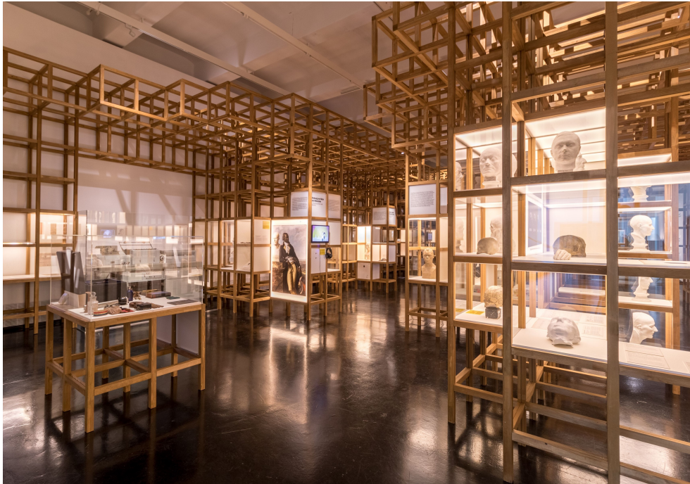
A wooden installation in form of a shelving system represents the thinking in racial categories.