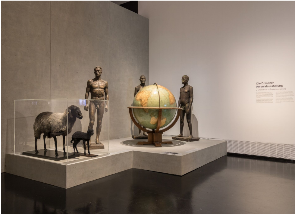
Original exhibits from the "German Colonial Exhibition," shown in 1939 at the Dresden city hall Author: Andrea Maretto for Kéré Architecture