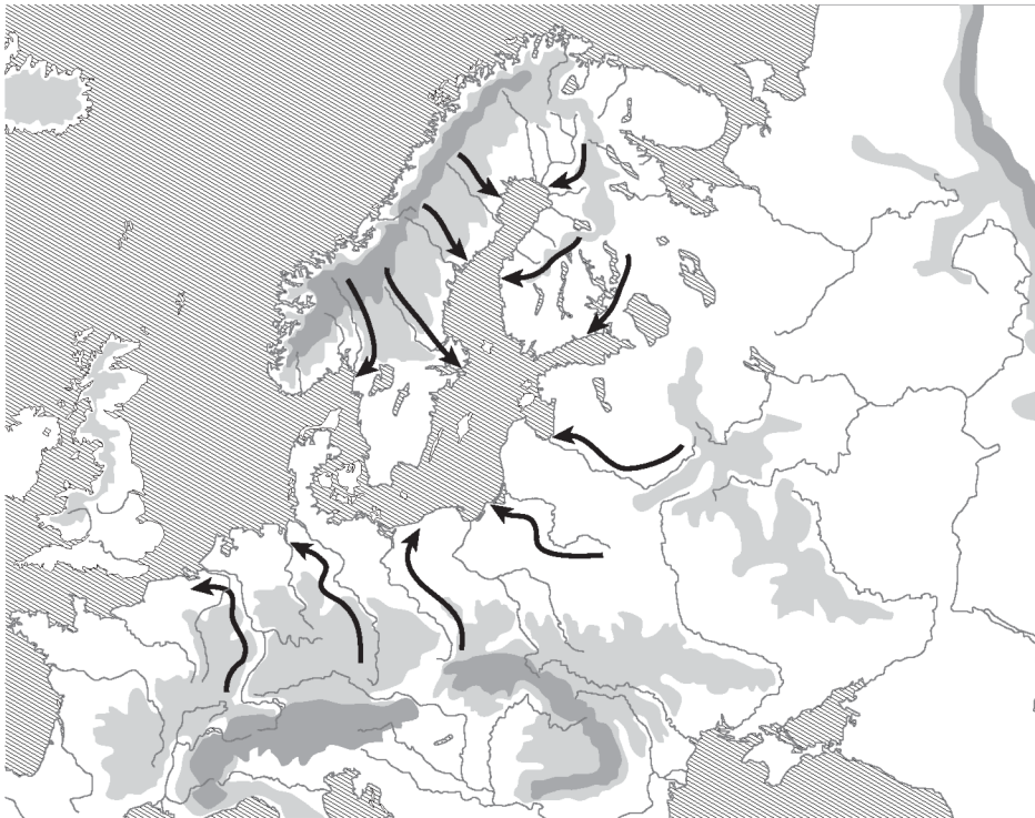
Map 1. Mono-directional timber transport: Directions of timber floating in the Baltic and North Sea Region, c. 1800 (cartography: Christian Lotz, 2016)

By contrast, from the mid-19 th century onwards, the railway as a new technology overcame many topographical barriers. It enabled a multidirectional timber transport; now timber could be transported in every direction. When railway tracks arrived in a particular inland region, the local people were no longer forced to rely on their local forests, but could import timber uphill from other regions via the railway.